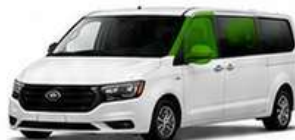
Rear Side Windows