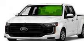
Additional Reflection-Prone Areas