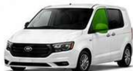
Front Side Windows